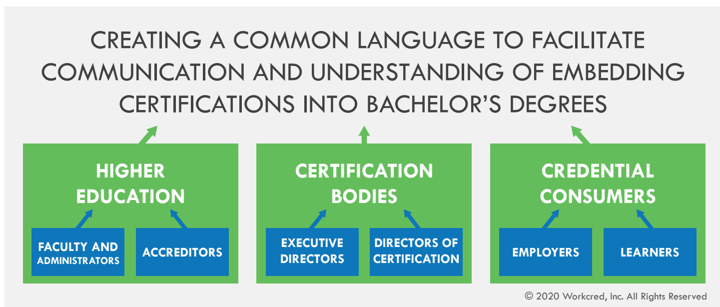
Figure 1: Creating a Common Language

Across all of the convenings, the information received through the use of surveys showed an increased understanding by attendees of the university curriculum development process and the certification exam development process after attending a convening. In particular, very few—and sometimes no—respondents indicated that they still did not understand these processes. 10 Additionally, changes from pre-convening survey responses to post-convening responses for other questions strongly suggest a more nuanced understanding of the value and ability of partnerships between certification bodies and universities. For example, there were some significant shifts in the number of respondents who selected it was “very possible” to align university curriculum and certification exam content, reflecting a change in viewpoint due to participation in the convenings. Fostering a better understanding and actively using a common language about credentials (see Figure 1: Creating a Common Language) was critical to facilitating constructive conversations, and ultimately served to strengthen the relationship between the university and certification body attendees.